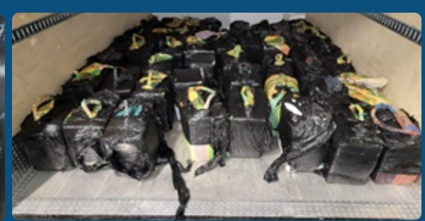
40-foot vessel with 1597.9 Kg of cocaine seized on August 9th, 2024.