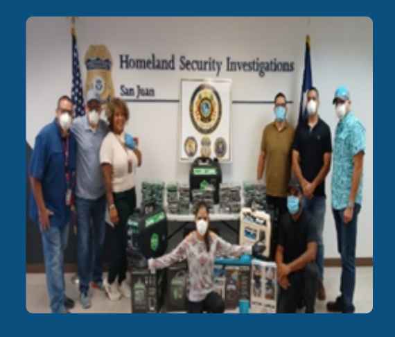
Recent AIRTAT seizures.

During this quarter, AirTAT agents continued to conduct strategic interdictions at the terminals of the Luis Munoz Marin International Airport. In addition, AirTAT agents have been conducting inspections at the cargo areas of the airport and at the United States Postal Services (USPS) facilities in order identify packages contained narcotics destined to the Continental United States (CONUS). As a result, AirTAT agents have seized a total of 805 kilograms of cocaine, arrested individuals transporting cocaine and seized $86,450 in assets as a result of multiple investigations.