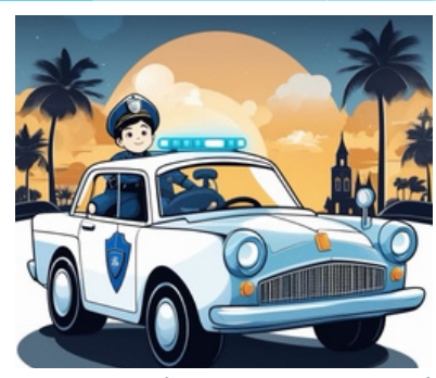
PR-USVI HIDTA 3rd Quarter 2024 Newsletter