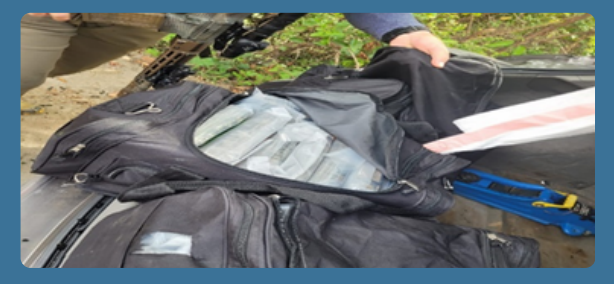
Bags containing 61 kilos of cocaine seized August 28, 2024

On August 28, 2024, Law Enforcement partners received information from the Royal Virgin Islands Police Force (RVIPF) that a known DTO, was transporting a quantity of cocaine from Tortola, British Virgin Islands (BVI) to St. John, USVI, via maritime conveyance. Moments prior to this intel, CBP AMO STTMU surveillance captured 2 individuals (one of which was armed with an AR-15 rifle) traveling along a remote trail in St. John, USVI, that is utilized by drug traffickers to receive quantities of cocaine from the BVI, via maritime conveyance. Moments later, the 2 individuals were observed exiting the trail, now carrying multiple duffle bags, then depart the area driving a small SUV.