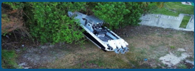
38 foot go fast beached after chase on August 25, 2024

The pick-up vessel ran aground, and all three (3) occupants absconded. RVIPF ultimately seized the 38' Fountain Center Console with three (3) Mercury 300 Outboard Engines valued at approximately $350,000. This investigation is ongoing.