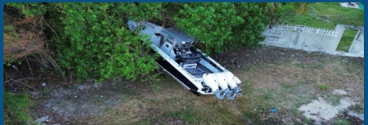
38 foot go fast beached after chase on August 25, 2024

The pick-up vessel ran aground, and all three (3) occupants absconded. RVIPF ultimately seized the 38' Fountain Center Console with three (3) Mercury 300 Outboard Engines valued at approximately $350,000. This investigation is ongoing.