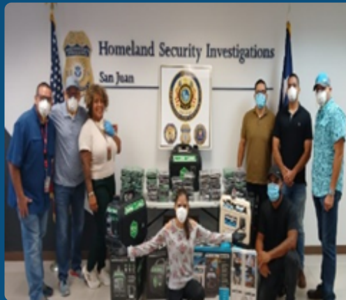
Recent AIRTAT seizures.

During this quarter, AirTAT agents continued to conduct strategic interdictions at the terminals of the Luis Munoz Marin International Airport. In addition, AirTAT agents have been conducting inspections at the cargo areas of the airport and at the United States Postal Services (USPS) facilities in order to identify packages that contained narcotics destined to the Continental United States (CONUS). As a result, AirTAT agents have seized a total of 805 kilograms of cocaine, arrested five individuals transporting cocaine and seized $86,450 in assets as a result of multiple investigations.