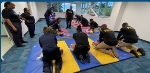
Picture left: First Responders on St. Thomas at a Naloxone training. Picture right: First Responders and instructors group photo.

The goal of the Virgin Islands HIDTA Prevention Initiative is to continue its quest to ensure that all (as many we can) First Responders are versed and knowledgeable in the seriousness of the opioid crisis affecting people in the United States, and the Caribbean Each segment of the training is very important, especially for First Responders. In the event of an opioid exposure to a fellow First Responder or citizen, and the naloxone does not work, and the officer on the scene is not trained to do CPR, and is not equipped to do CPR, it is a possibility that the person could die if it takes too long for an ambulance to arrive on the scene. That is why this training, especially the hands-on part of it, is so important. Naloxone training can be done quickly, but there is much more to saving a life.