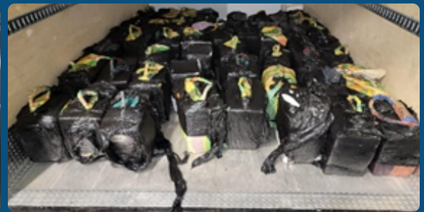
40-foot vessel with 1597.9 Kg of cocaine seized on August 9th, 2024.