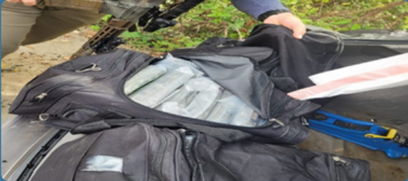
Bags containing 61 kilos of cocaine seized August 28, 2024

On August 28, 2024, Law Enforcement partners received information from the Royal Virgin Islands Police Force (RVIPF) that a known DTO, was transporting a quantity of cocaine from Tortola, British Virgin Islands (BVI) to St. John, USVI, via maritime conveyance. Moments prior to this intel, CBP AMO STTMU surveillance captured 2 individuals (one of which was armed with an AR-15 rifle) traveling along a remote trail in St. John, USVI, that is utilized by drug traffickers to receive quantities of cocaine from the BVI, via maritime conveyance. Moments later, the 2 individuals were observed exiting the trail, now carrying multiple duffle bags, then depart the area driving a small SUV.